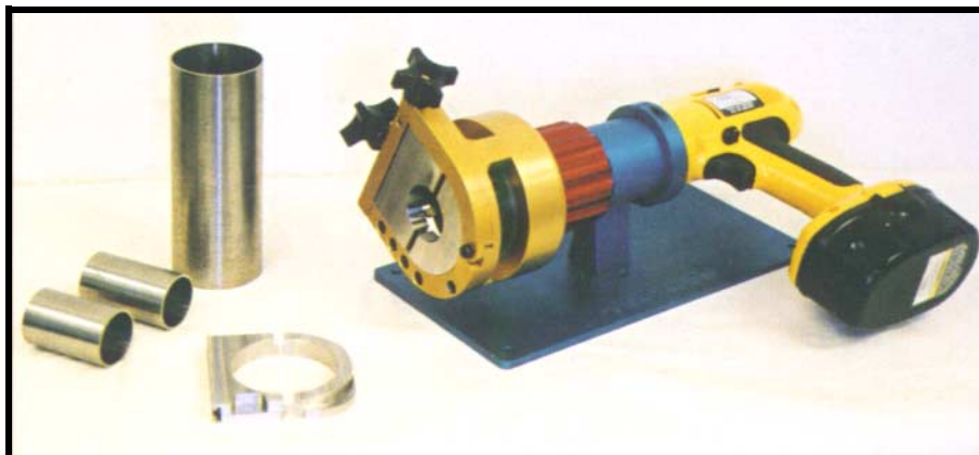
Cordless DC Version with Bench Mount