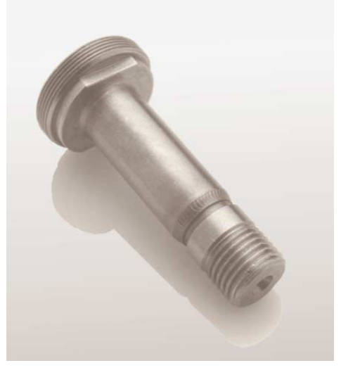
Joined by an arc welding technique, this solenoid component has a pulsed arc finish on the weld surface.

Precision welding is required for the manufacture of parts such as enclosures, batteries, capacitors, metal seals, pressure devices, sensors, surgical tools, and many other metal components. Because of the need to maintain part integrity, the sealing, shaping, or joining technique must be extremely reliable. The welding process must also be accomplished without detriment to the function or cosmetics of the part.