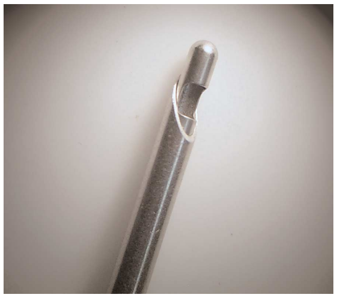
By imposing a welding arc for a controlled period of time, welders can close small diameter tubes to a perfect hemisphere.

obtain numerous benefits. These include improved arc starting, increased arc stability, and more consistent weld penetration; longer electrode life before wear or contamination; and reduction of tungsten shedding, which minimizes the possibility of tungsten inclusions in the weld. A dedicated electrode grinder helps ensure that welding electrodes do not become contaminated by residue or material left on a standard shop grinder wheel. Also, tungsten electrode grinding equipment requires less skill to ensure that the tungsten electrode is ground correctly and with more consistency.